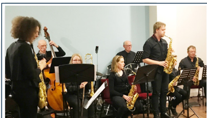
The Raglejazz Band demonstrated the wonderful skills of improvisation